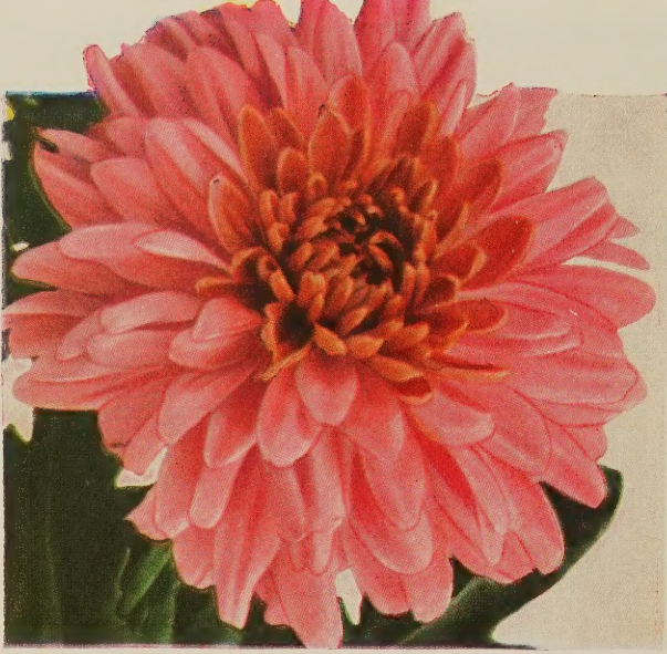
BETTY. 50c each; 3 for $1.25